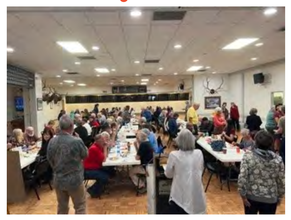
Continued on following page ...